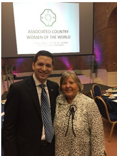
USA Embassy Representative attending “International Women’s Day Networking Breakfast” London