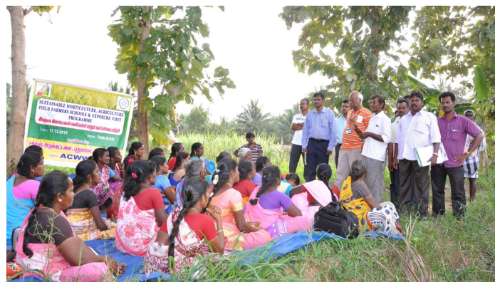
Education classes in session