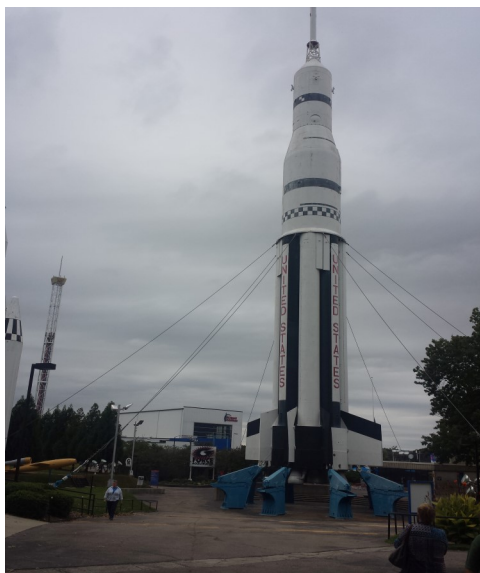
Space Center Rocket