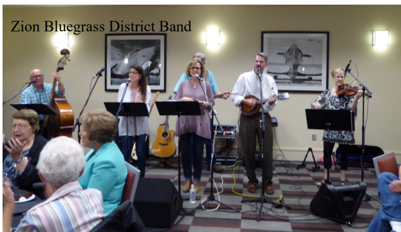
Zion Bluegrass District Band