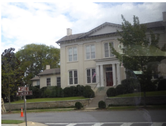
1848 Home seen on tour of Twickenham District. One of many we drove by.