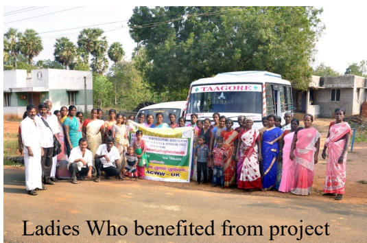
Ladies Who benefited from project

India – Success Trust - Promotion of indigenous rice and vegetables cultivation among marginal women farmers and prevent their migration to towns – No. 1007