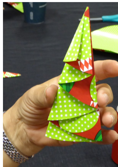
Craft time - Folded tree