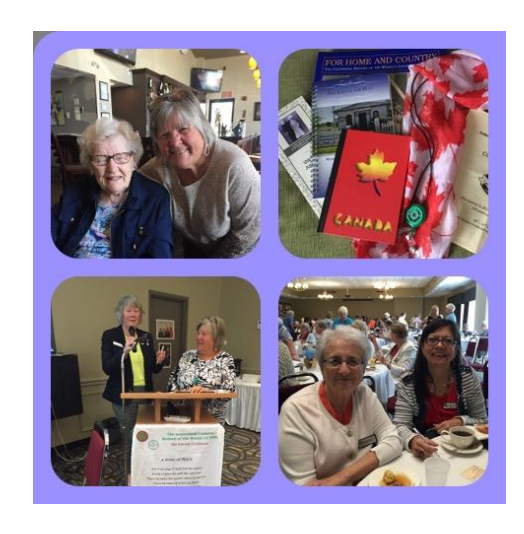
ACWW Canada Area Meeting