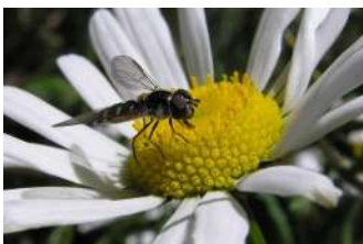
Pollinators come in many forms.

Resolutions Proposed by Country Womens Council USA