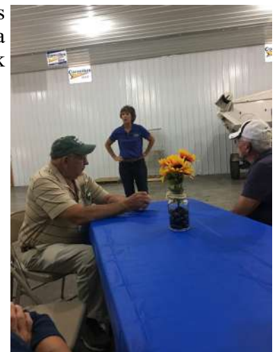
Cornelius Seed Corn tour