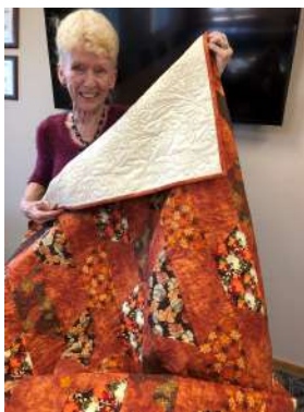
The quilt winner. Congratulations