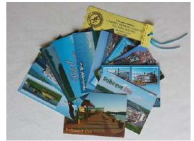
Postcards sent to Friendship participants

What a lovely way to connect us all with the post card."