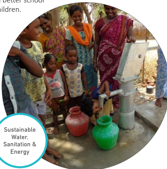
Sustainable Water, Sanitation & Energy