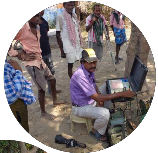
A geologist surveys the land to find water under the surface

Water projects are very simple in their concept, inputs, and programme, but they can be transformative for communities, giving them potential for improved health, better sanitation, and better school attendance among children.