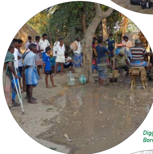
Digging the Borewell