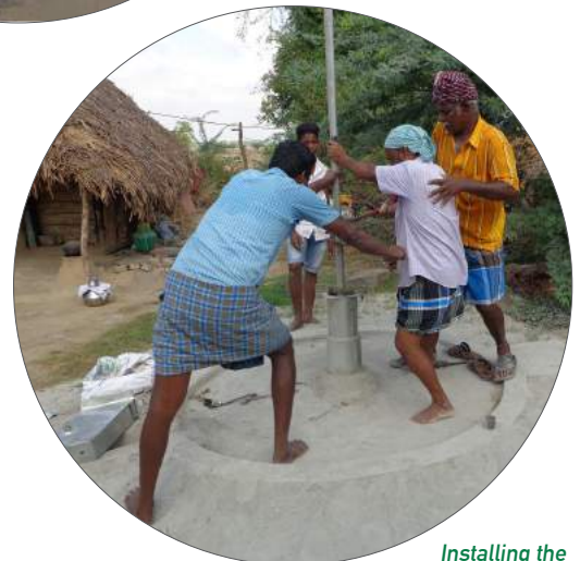
Installing the hand pump