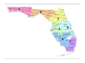
Florida "The Sunshine State"

Home to Florida Association of Home and Community Educators