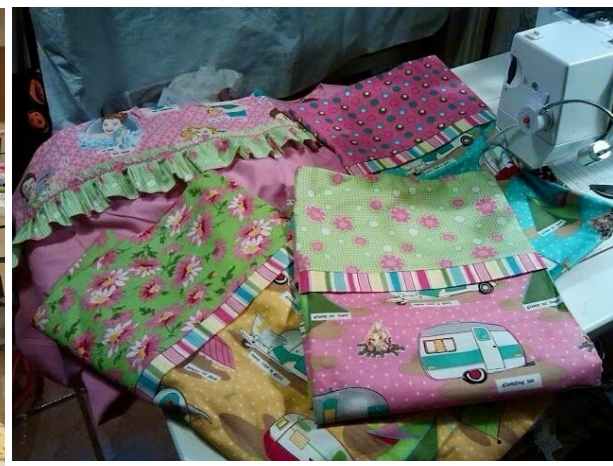
Finished pillowcases ready for children.