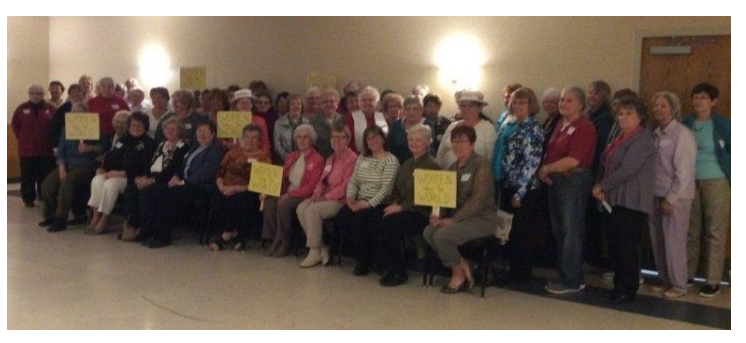
Wisconsin members gather after their walk for Pennies. 2015

at least 300dpi if digital. Remove date stamp if your camera puts one on the photo. Accompany the photo with a short write up describing your walk and submit to: Nick Newland nick@acww.org.uk