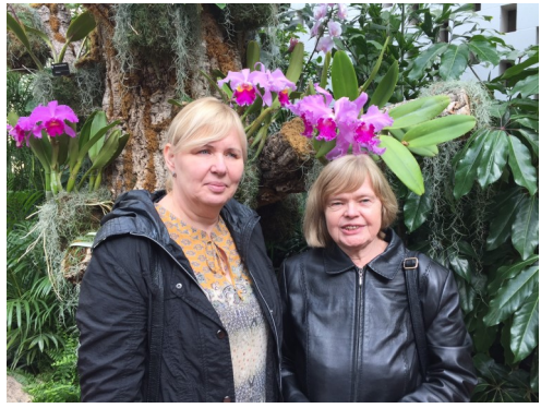
Visit to Missouri Botanical Gardens