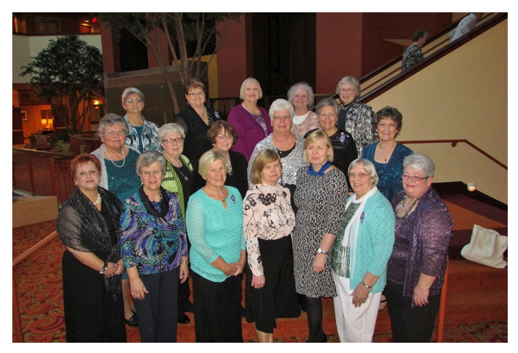
Illinois Association for Home & Community Education State Board with visitors from Estonia.

Illinois Association for Home and Community Education