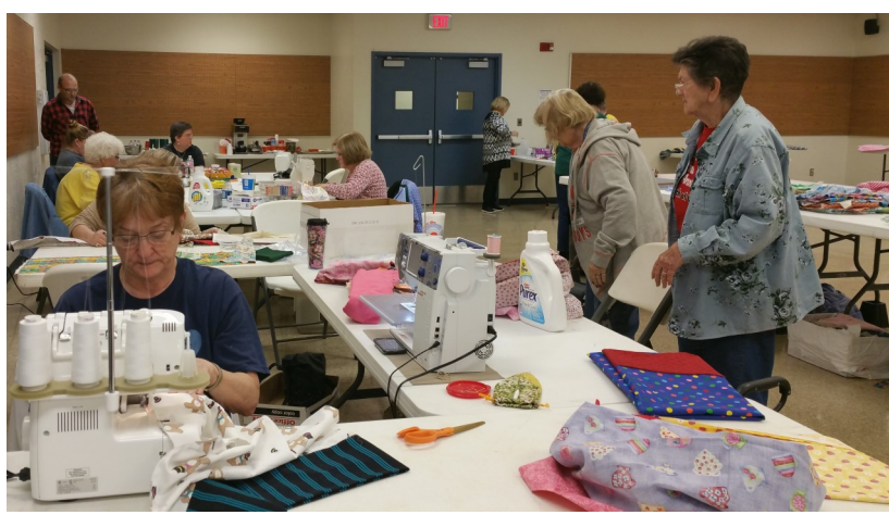
Pillowcases in progress

One can only say, "Congratulations for a job well done!"